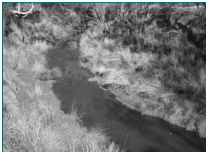
Figure 6.4. Vegetated bench in Honeysuckle Creek, central Victoria

A key part of this research will be the field testing of the data acquired in the flume experiment. If you are aware of any sites that have grassed benches within the channel, are relatively close to a flow gauging station and are fenced to exclude stock, then I would be keen to hear from you. Honeysuckle Creek (Figure 6.4) is a good example of the sort of site I'm looking for. The aim is to collect field data during April and May this year.