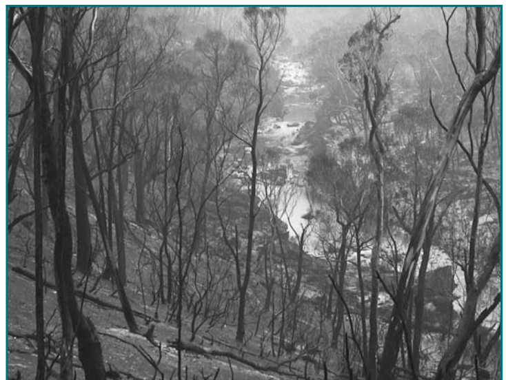
Fire scorched catchment between Omeo and Anglers Rest in Victoria.