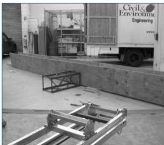
Figure 6.1 Flume under construction in Melbourne University workshop

A key feature of the flume design used in this study is that it allows any number of vegetation samples to be tested. This flexibility allows variability in resistance between different grass species and different substrates to be examined. Vegetation samples are obtained for testing by extracting vegetated blocks from selected riparian sites, using a steel slicing and lifting mechanism. This method has been developed to minimise disturbance to the integrity of the substrate.